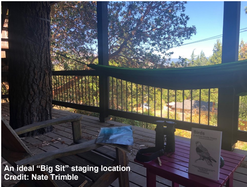
An ideal “Big Sit” staging location.

I had many grand ornithological adventures planned this spring and summer that unfortunately were canceled or put on hold due to the Covid-19 pandemic. Field work, leading field trips, birding festivals, group surveys, all right-ly canceled to protect the health of our community. While Covid-19 has thrown a wrench into so many of my plans, the situation we find ourselves in now has also given me more time to just sit and watch birds, especially the birds in my yard.