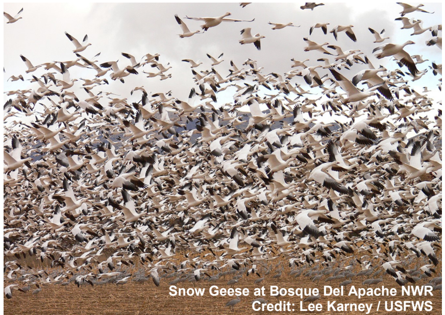
Snow Geese at Bosque Del Apache NWR

Caproni eviscerated that reading of the law. Powerfully referencing To Kill a Mockingbird , she wrote "It is not only a sin to kill a mockingbird, it is also a crime." That has been the letter of the law for the past century. But if the Department of the Interior has its way, many mockingbirds and other migratory birds that delight people and support ecosystems throughout the country will be killed without legal consequence."