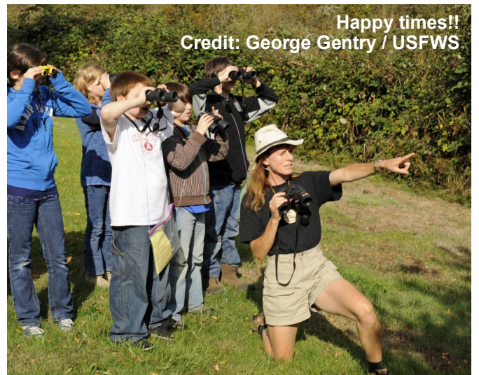
Happy times!!

We look forward to birding with our friends again when the COVID circumstances improve. In the meantime, we encourage our members to continue their own birding adventures with their households or quarantine bubbles. Or participate in our Great Fall Migration Big Sit (details on page 4)!