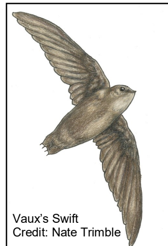
Vaux's Swift

4/27 - 911 5/3 - 1,015 5/4 - 569 5/14 - 560 5/18 - 678