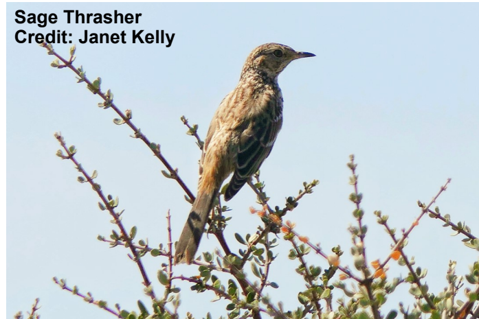
Sage Thrasher

Great Horned Owls are hooting with more regularity in the early mornings and at night.