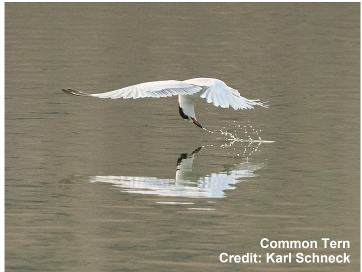
Common Tern

Rufous Hummingbirds continue moving through southern Oregon; one was at a feeder in the Little Apple-gate Sep 23. (MH) And of course Anna's Hummingbirds continue, so keep those feeders up through the winter if you can as some do stay.