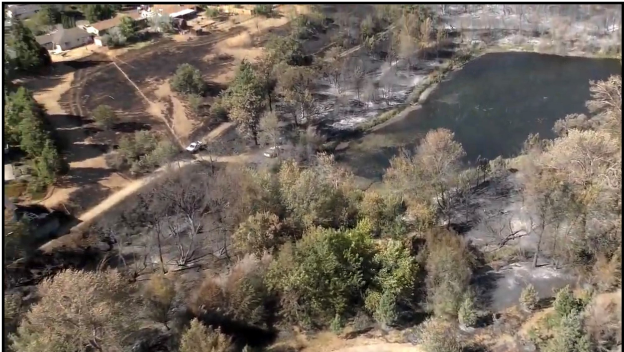
View of Ashland Pond taken from Jackson County Sheriff’s helicopter flyover shortly after the fire.

NOTE: On Sunday, September 20, a sign was posted at the Ashland Pond entrance from Glendower warning that the area is closed due to hazardous conditions. Birders shouldn’t attempt to access Ashland Pond until the closure is lifted.