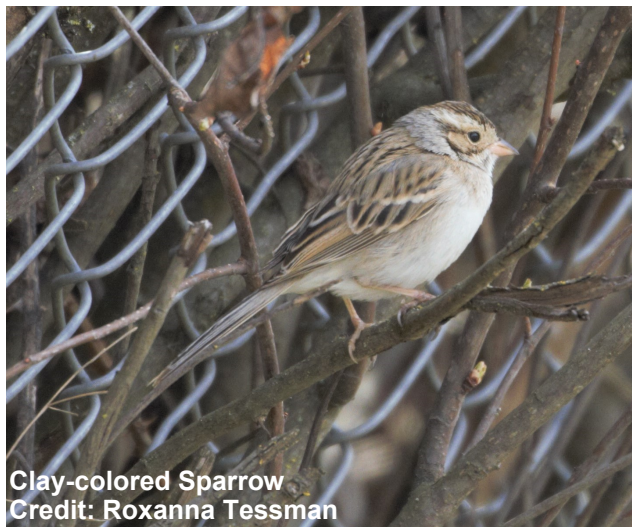
Clay-colored Sparrow