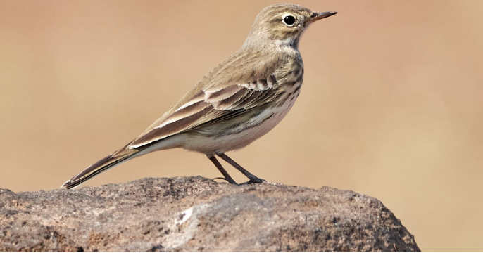
American Pipit

the Ashland portion Sept. 26 (LH, MW). A Blue-gray Gnatcatcher was in North Mtn. Park Sept. 8 and another was at Emigrant Lake Park Sept. 9. Their numbers seemed to be down this summer in our area.