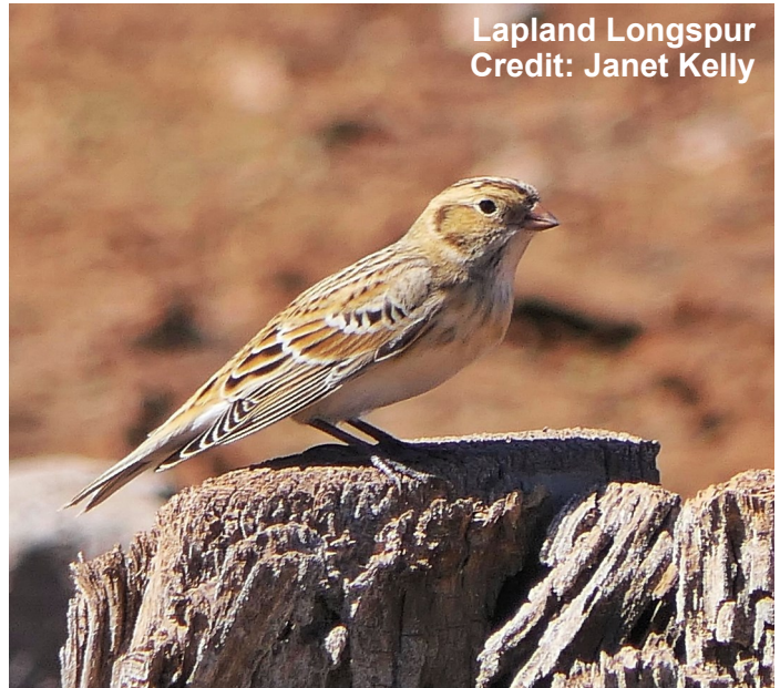
Lapland Longspur

All errors and omissions are my own. Peace.