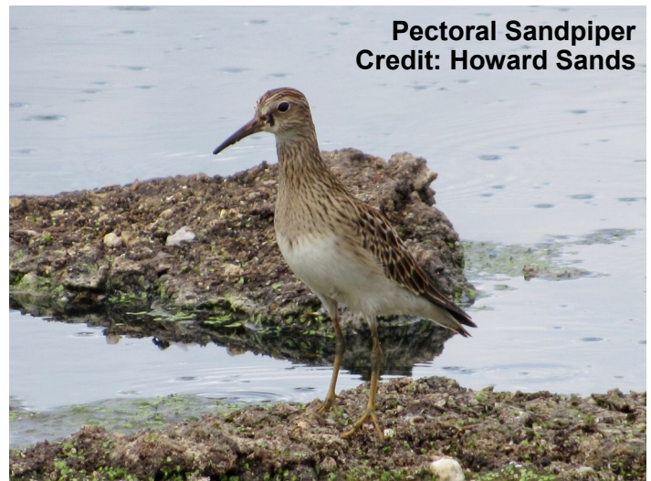
Pectoral Sandpiper

It's getting late for Western Wood-Peepees and Willow Flycatchers. A Western Wood-Peepee was seen along the Bear Creek Greenway in Talent Sept. 26 (PT). A Willow Flycatcher was spotted at Ashland Pond Sept. 15 and 18 (NT, CM).