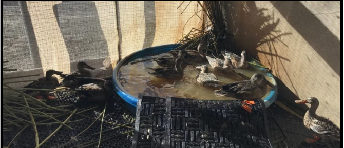
Northern Shovelers and other ducks in care at the avian hospital on the Lower Klamath Basin Refuge.

Unfortunately, refuge staff are no longer picking up sick or dead birds because hunting season has begun and they