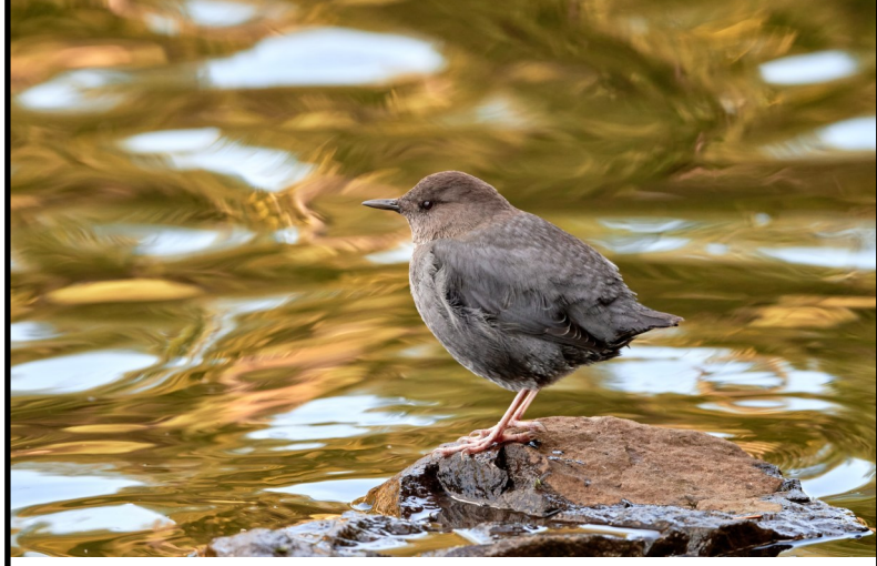
American Dipper looking dapper for the CBC crew