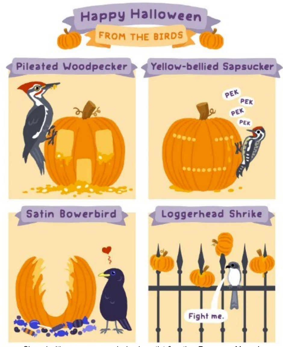
Shared with generous permission by artist & author Rosemary Mosco! Find more at <u>birdandmoon.com</u> or <u>instagram.com/rosemarymosco/?hl=en</u>.

<u>Directions to meeting spot</u>: We will meet at the entrance off Agate Rd. between 1/4 and 1/2 mile past the fire station on the left side of the road. Coming out Table Rock Rd., turn right on Antelope Rd. and go to the light on Agate Rd. and turn left. The fire station will be on your left at the corner of Ave. G and Agate Rd. Go 1/4 to /12 mile past the fire station and the gate will be on your left. Coming out on Highway 62 to Antelope Rd., turn left and go to the next light. Turn right and continue to the gate on Agate Rd.